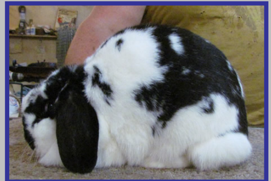
Lil' Roses Miss MLRCA BOB winner at Friendly RBA #2 Galesville, WI BOS at Northwood's #1 at Antigo and BOB at Red Cedar RBA Austin, Mn,