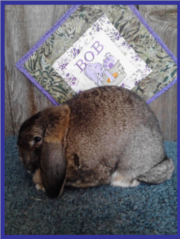
Milkhouse's Cool Black Water