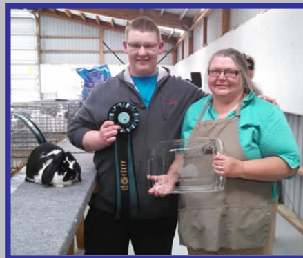
David's/Milkhouse Colt 45

David's Ovard/Milkhouse Colt 45 won BIS ISRBA show.