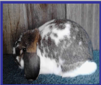
Milkhouse's Candy Stripper